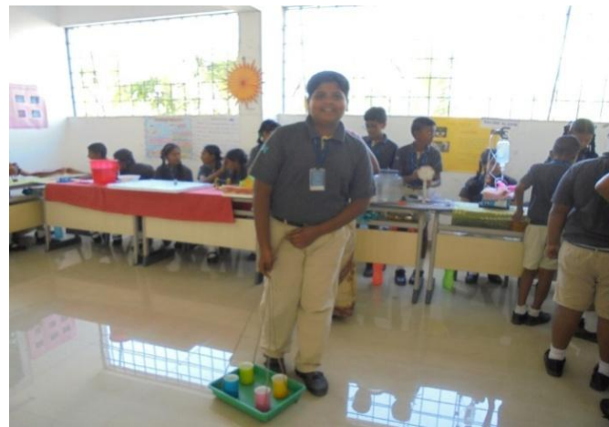
Students Displaying their Working Models