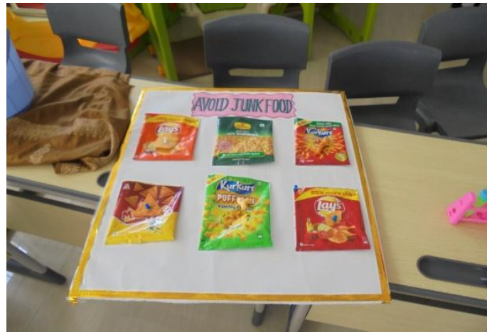
Students Displaying their Working Models