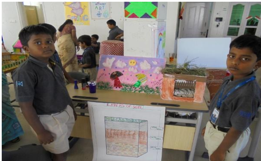
Students Displaying their Working Models