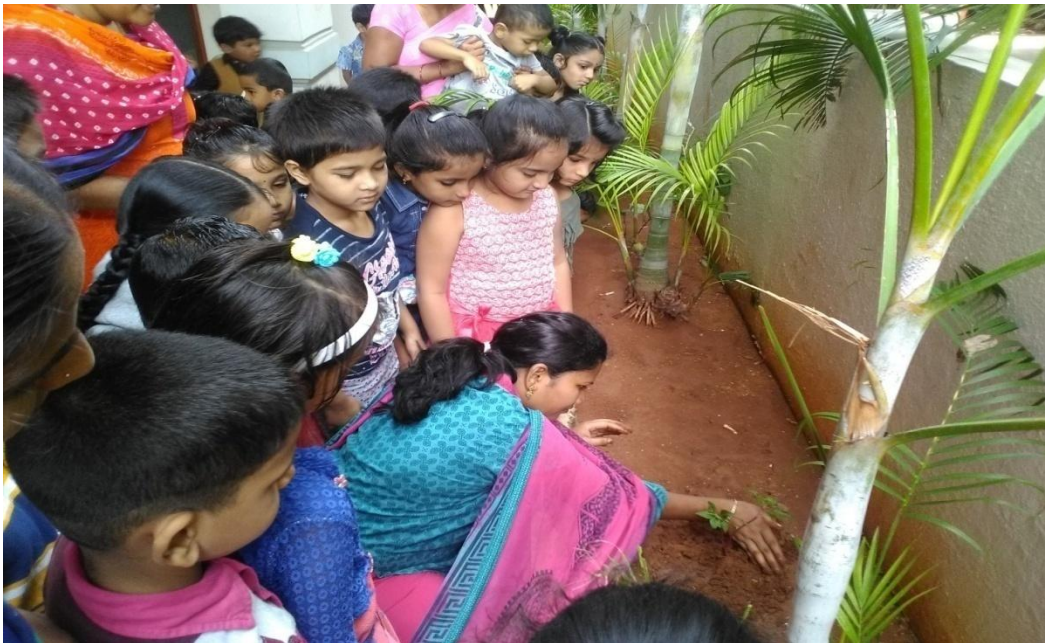
Students participating in soil conservation awareness event

We created awareness and lasting habits of eco-friendliness among students by conducting a special assembly on Soil conservation, Earth Hour and Earth Day.