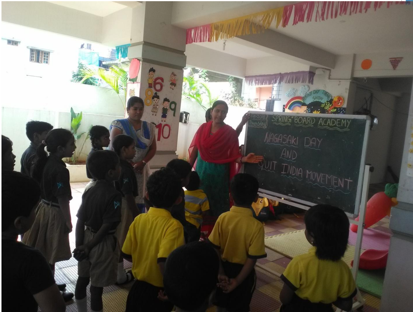
Teacher Explaining about Quit India Movement