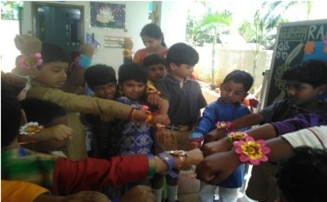
Spirit of Raksha Bandhan

Spring Board Academy, celebrated Raksha Bandhan on August 23, 2018 . The school organized a special event to educate students about the significance of this festival. Students wore colourful traditional Indian dresses. Rakhi making activity was organized in the school and children were told about the sacred bond between a brother and a sister. Girls tied rakhi on the wrist of boys. Sweets were distributed among students.