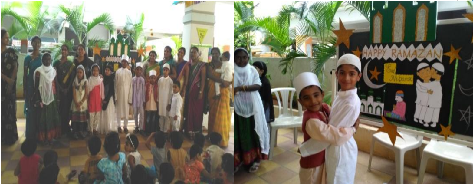
Skit presentation by primary students

Students celebrated Ramzan festival in the campus on June 15, 2018, marking the beginning of such celebrations and assemblies. The meaning of Ramzan is explained to all the students. Primary students demonstrated a small skit on the significance of Ramzan.