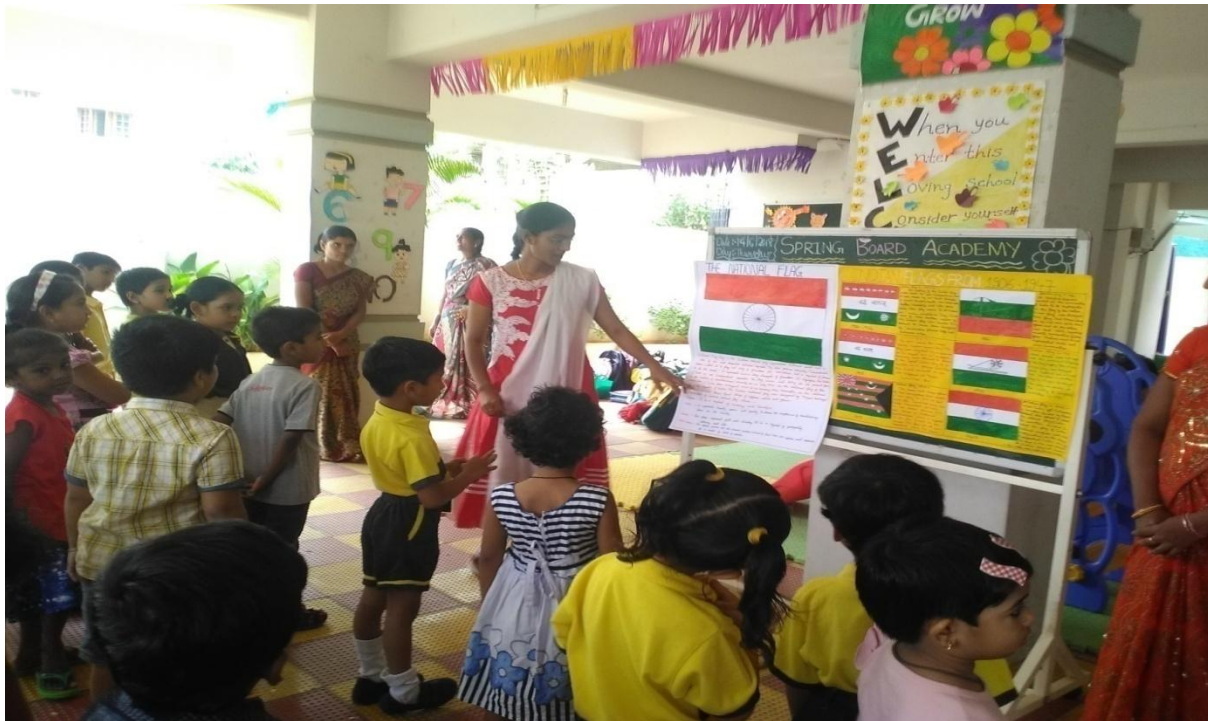
Students being explained about the design of National flag

Students of Spring Board Academy observed National Flag Day on June 14, 2018 in the school campus. Teachers displayed charts depicting the importance of the national flag. They spoke about Sri Pingali Venkaiah, designer of our national flag.