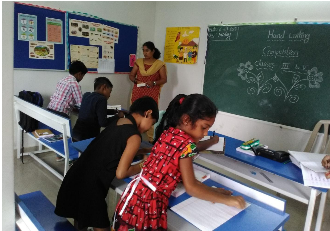
Children participating in handwriting competition