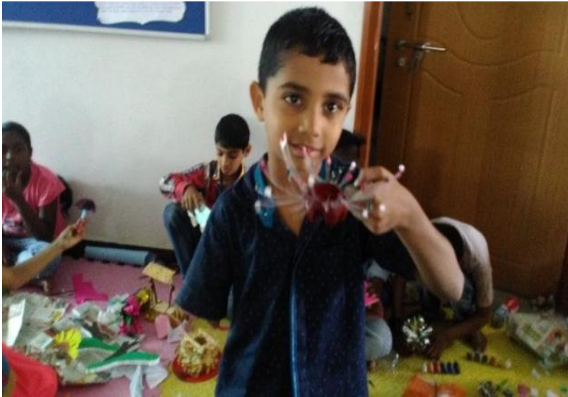
Students involved in Art activity