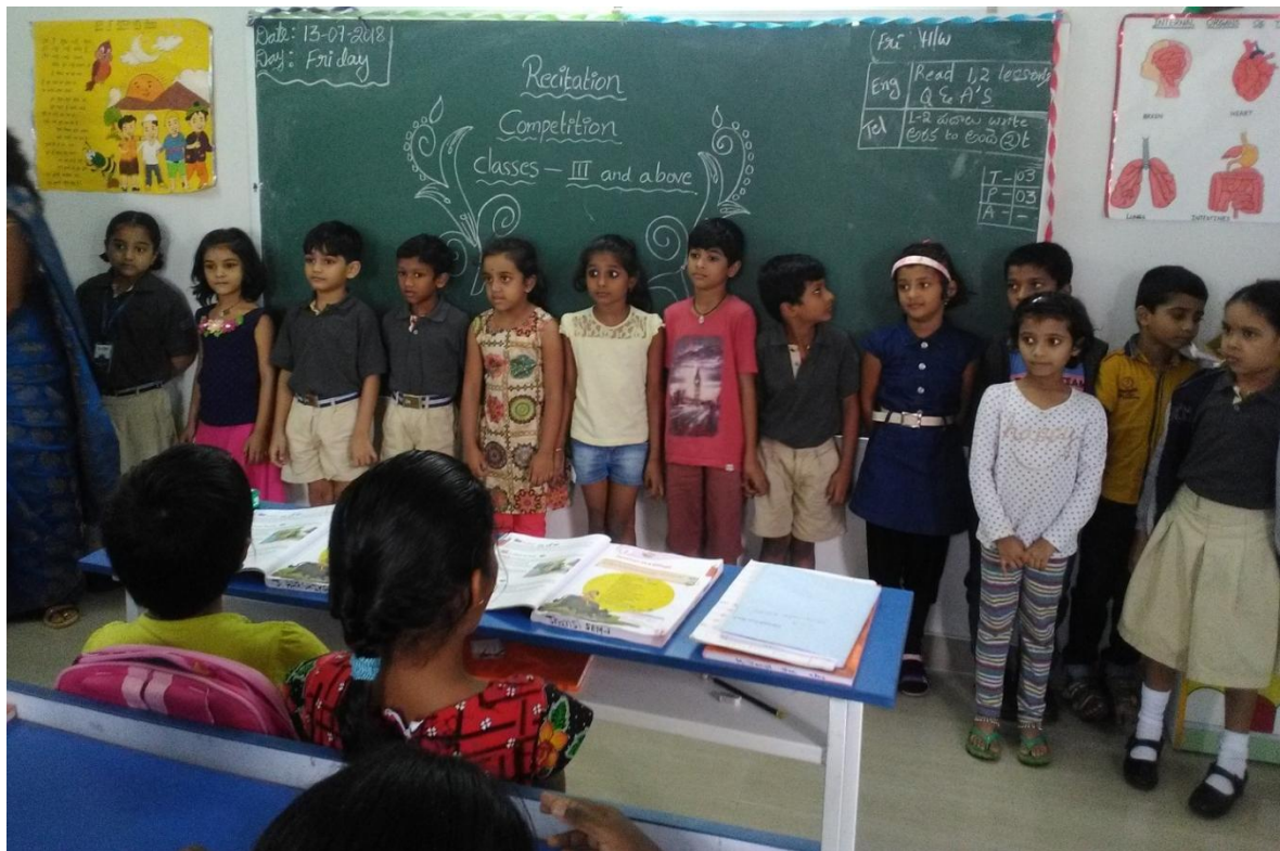
Students Reciting Poems

An inter-house English recitation competition was held on July 13, 2018 for the students of grades III and above. Students recited the poems beautifully. This activity was organized to enhance the speaking skills and uplift the confidence of children. Children got an opportunity to express their talent and confidence.