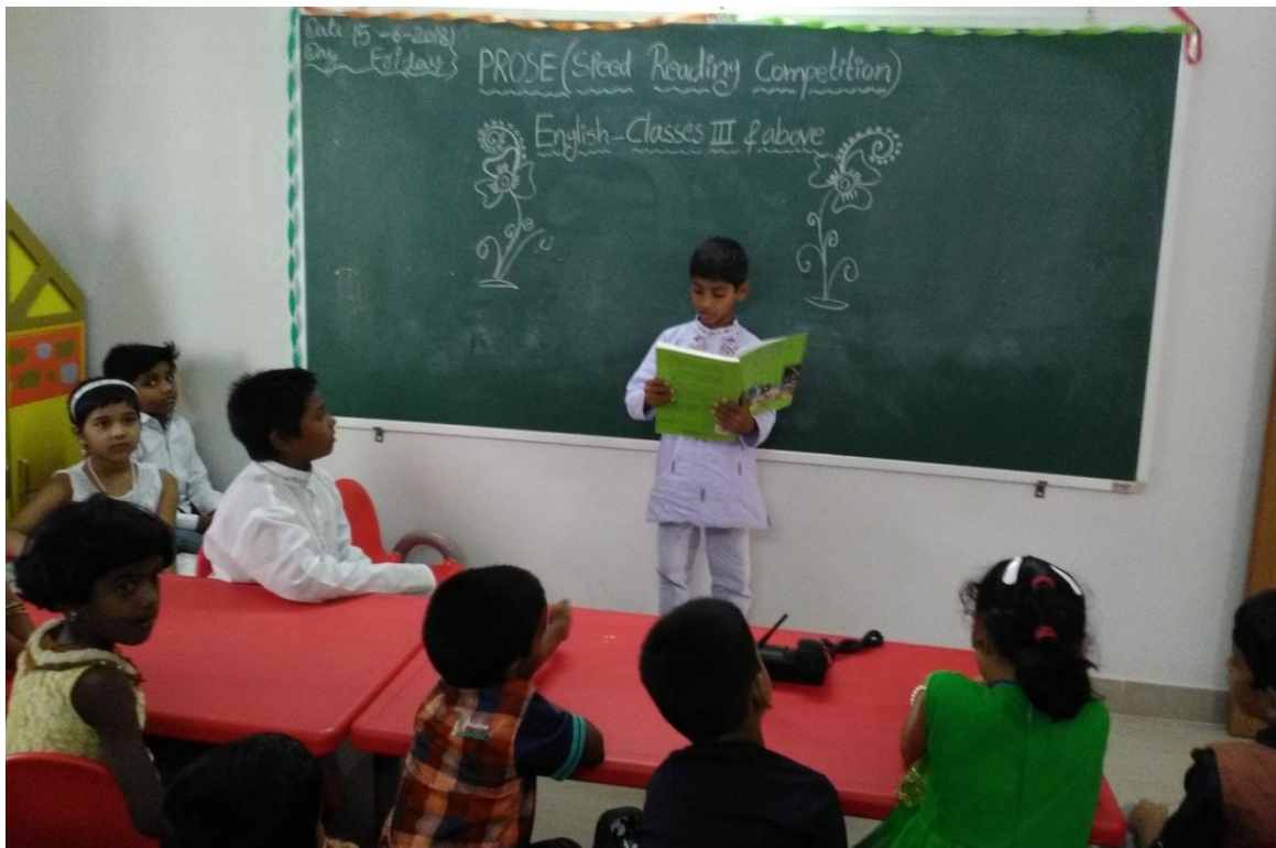
A student participating in prose reading competition

Prose reading competition was held for primary students on June 15, 2018. The theme was “Read, Explore and Discover.” Such competitions are held to improve their vocabulary and reading fluency. These skills are the foundation of a successful student, regardless of their career path.