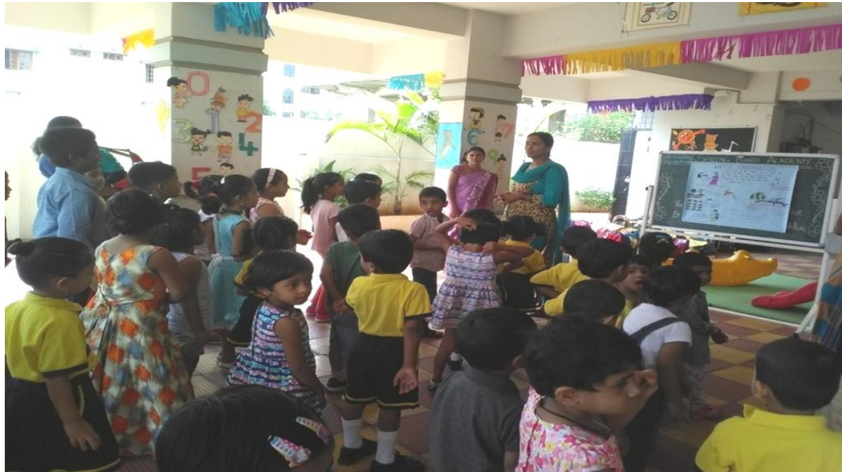
Assembly on water conservation

Special assembly on Water Conservation was conducted on June 6, 2018. Water is a precious resource and conserving water helps reduce the amount of water utilized from rivers and groundwater. Conserving water reduces a school's carbon footprint. Students learnt the best practices to conserve water. Students were explained the importance of having leak free faucets and signage indicating the wise use of water at school and home.