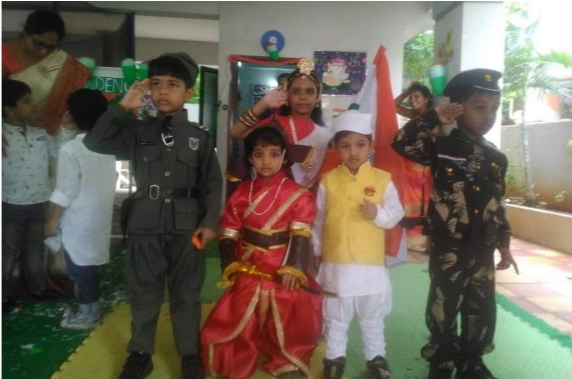
Students Dressed as Freedom Fighters

Independence Day was celebrated with great zeal and enthusiasm on August 15, 2018. Students participated in different cultural activities which included patriotic dance performances. The school premises looked bright and colorful with the children and staff dressed in colors of national flag. Energetic chants of “Jai Hind” echoed all over the school campus.