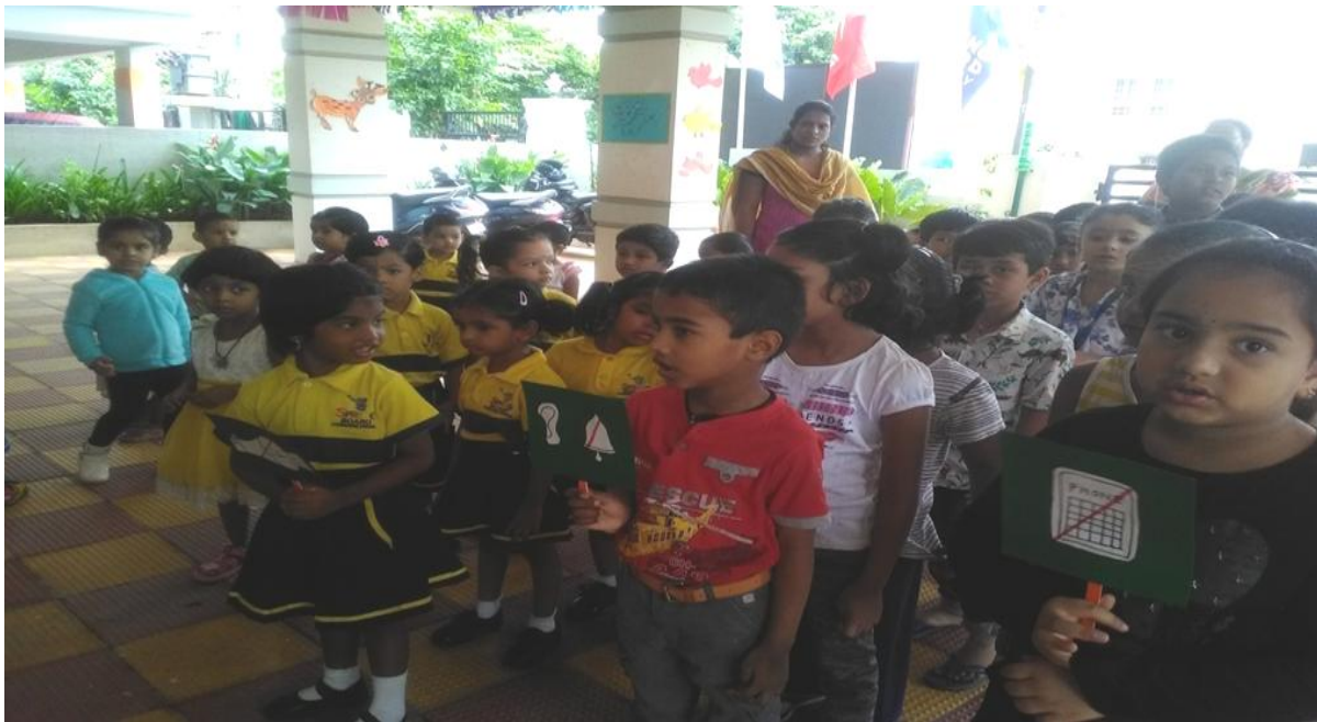
Students holding placards about Noise Pollution

Teaching staff conducted a special assembly on noise pollution for the students of Spring Board Academy on June 7, 2018. They explained about the causes and effects of noise pollution. In the modern era of development and innovation, noise levels are always on the rise. Hence, it is important to adopt ways which help us to prevent noise pollution.