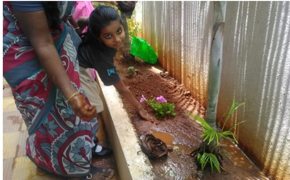
Students Planting and Watering the Trees