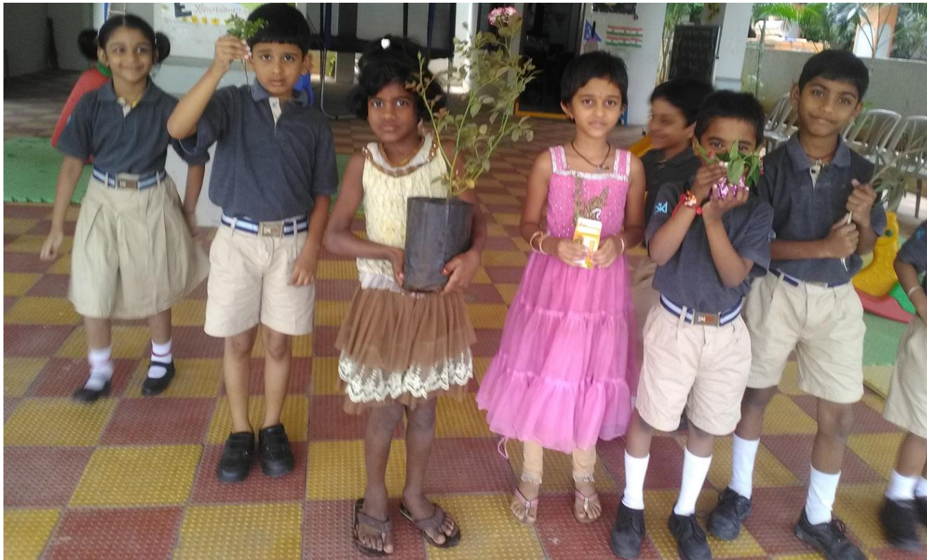
Students with plant saplings during Go Green activity

With the main objective of preserving our environment, students celebrated 'Go Green Day' on August 31, 2018. The students took part in a myriad of 'Go Green' activities by planting saplings and carrying out clean up drives.