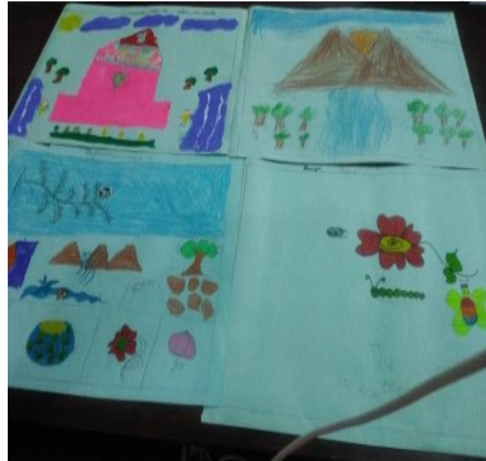
Students drawing and Coloring