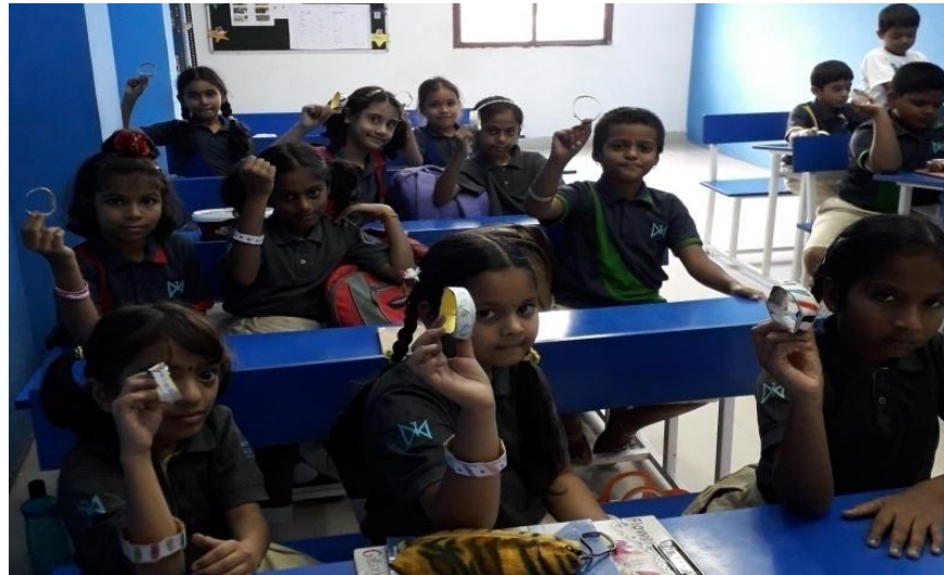
Paper bracelets made by grade IV