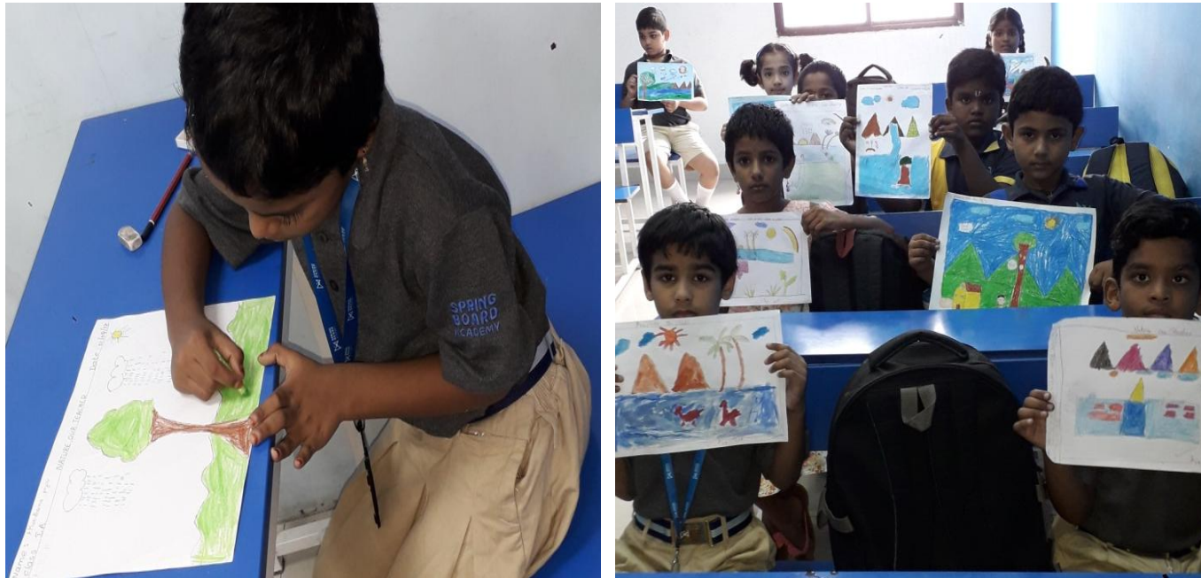
Children displaying their art

It was a day where we saw creativity exploding in every piece of art. Students portrayed beautiful pictures of nature depicting the ways to save our Earth. All the students participated in the competition enthusiastically.