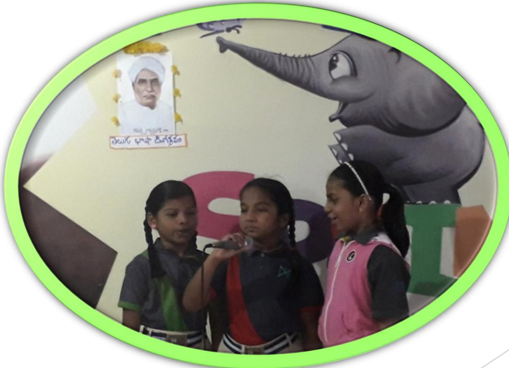
Students presenting a Telugu song

On 29 th August, 2018 we celebrated Telugu Bhasha Dinotsavam to mark the birth anniversary of Sri Gidugu Venkata Ramamurthy (1863-1940). Telugu department highlighted the works of Ramamurthy garu and explained his contribution to Telugu literature.