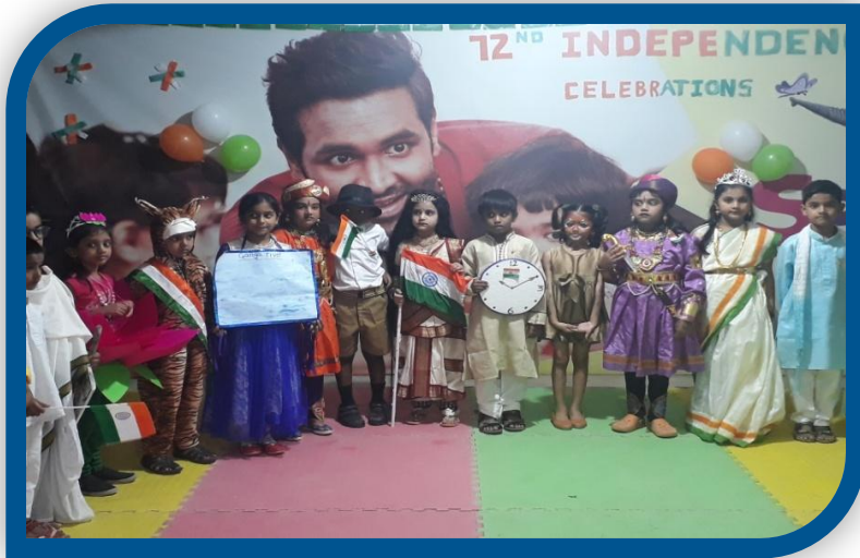
Fancy dress competition