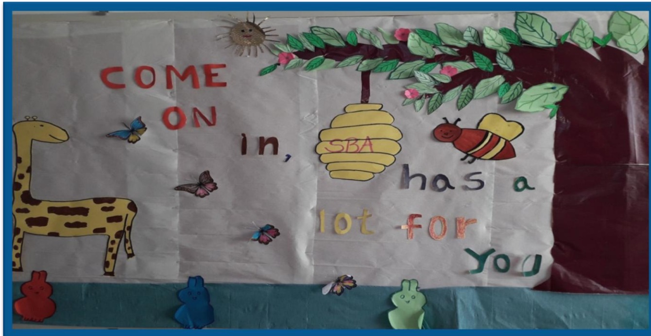
Charts on notice book welcoming students

The new academic year began from 11.06.2018 and students were welcomed by the Principal and teachers. Students were excited to be back to school for a fruitful academic year. Children were happy to receive welcome greeting cards from their class teacher.