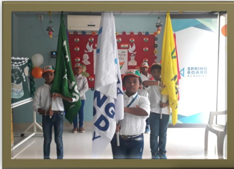
School house leaders