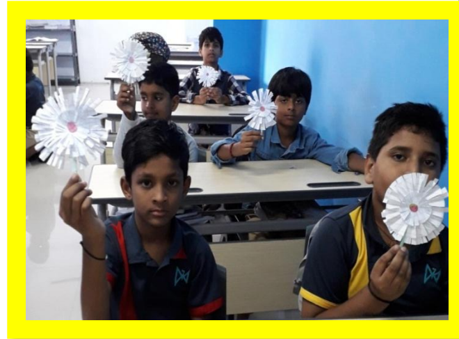
Paper flowers made by grade V