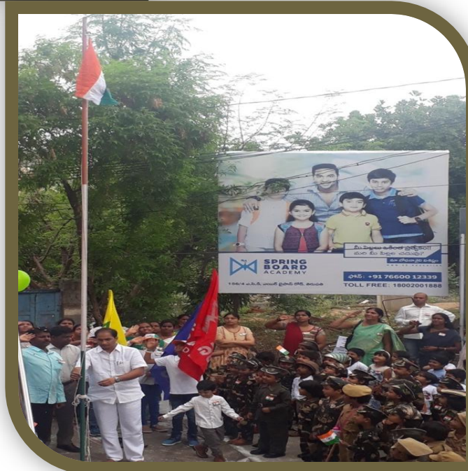
Flag hoisting by the chief guest