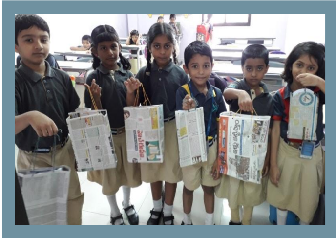
Paper bags made by grade II students