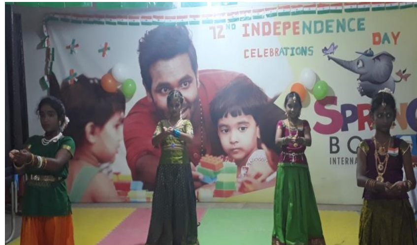
Performance by grade V students