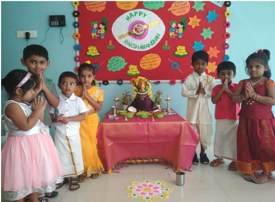
Spring Boardians offering prayers

Spring Board Academy celebrated Raksha Bandhan on 23. 08. 2018. Teachers and students assembled to highlight the significance of the festival. The tiny tots of the pre primary wing dressed in traditional attire.