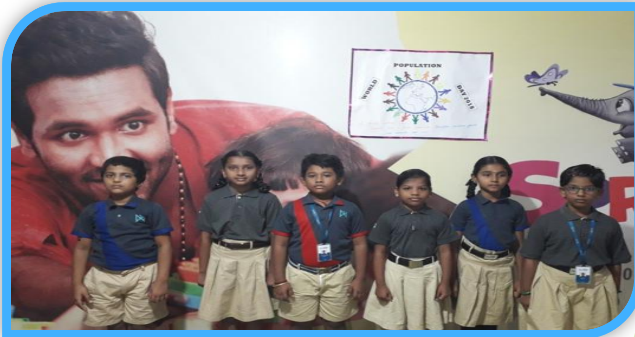
Students from grade III to V gave speeches about World Population Day

A special assembly was conducted on 11.7.2018 to sensitize the students about the ill- effects of population explosion. The theme of World Population Day, 2018 was “Family planning is a human right”. Students were made to understand the consequences of increasing population.