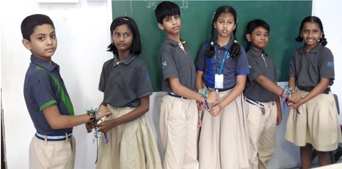
Raksha Bandhan celebrations